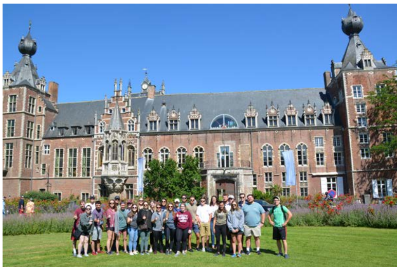
Arenberg Castle on campus of KU Leuven

Overview of federal and state environmental regulations focusing on permitting requirements for agricultural operations; operation of air pollution abatement systems to include cyclones, bag filters, and scrubbers; dispersion modeling; National Ambient Air Quality Standards.