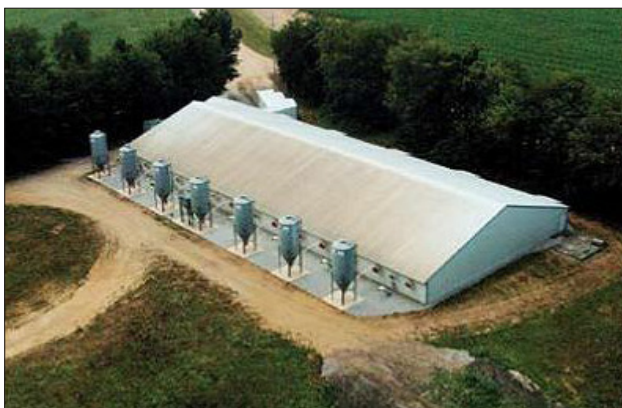
Figure 4. A windbreak around a swine barn (source: Harmon and Hoff, 2007b).

Studies show that dust and odorous gases in the exhaust air from liquid manure pit fans or from ventilated livestock and swine buildings can be reduced by 50 to 90 percent with biofilters that filter and treat the air. 5,7 Biofilters are usually