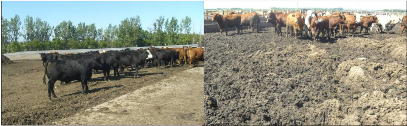
Figure 3. The feedlot surface on the left is well drained and properly managed, while the surface on the right is poorly managed.

4 hours before and after sunset when animals are most active.