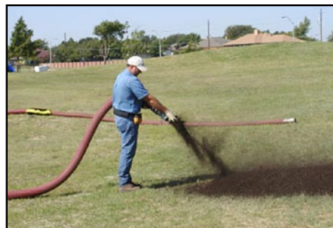
Figure 3. Grass seed and compost being applied as a filter berm to control runoff and sedimentation in a city park waterway.