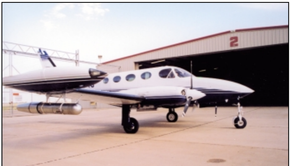
This Cessna 340 aircraft, equipped with belly racks and wingtip generators, is used for cloud seeding by three Groundwater Conservation Districts in the Texas High Plains.

Groundwater Conservation Districts use a variety of programs and media to inform the public about water issues and to raise public awareness of the need for water conservation. News releases and public service announcements distributed through newspapers, radio