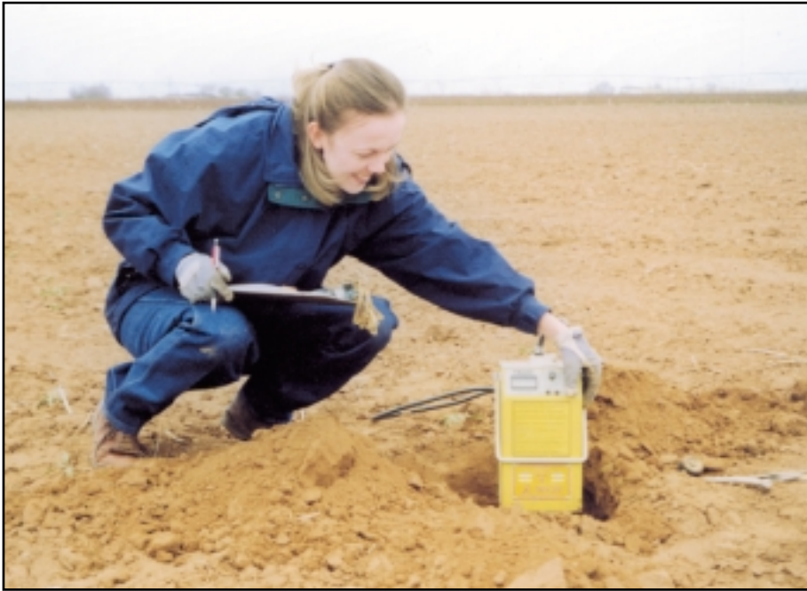
A moisture meter is used to collect pre-plant soil moisture data. This information helps producers know how much to irrigate before planting.

The Texas Water Code, Chapter 36, allows groundwater districts to levy property taxes to pay maintenance and operating expenses at a rate not to exceed 50 cents on each $100 of assessed valuation. Most district activities are funded through these ad valorem taxes, for which the maximum tax rates are set by local election. Districts surveyed reported ad valorem tax rates of $0.0045 to $0.0575 per $100 valuation. Hence, the annual tax paid on property valued at $100,000 ranges from $4.50 to $57.50.