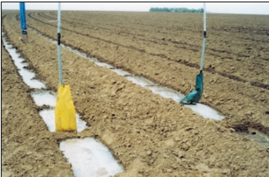
Using agricultural water conservation techniques, such as low energy precision application (LEPA) center pivot sprinklers and furrow diking, improves irrigation efficiency and conserves groundwater.

Groundwater Conservation Districts can provide a range of technical support services to help water users with conservation. Such services include monitoring precipitation and aquifer water levels. Several districts test wells, pump plant efficiency, and irrigation system efficiency. Water quality testing can vary from biological evaluations (coliform and fecal coliform bacteria) to more complete water quality analyses (including alkalinity, hardness, chloride, specific conductivity, total dissolved solids, fluoride, iron, ammonia, nitrate, sulfate and pH.) In some districts, water analysis is offered free of charge to residents of the district, and may be offered on a fee basis to residents outside the district. For specific information on water analysis services and fees, residents should contact their districts.