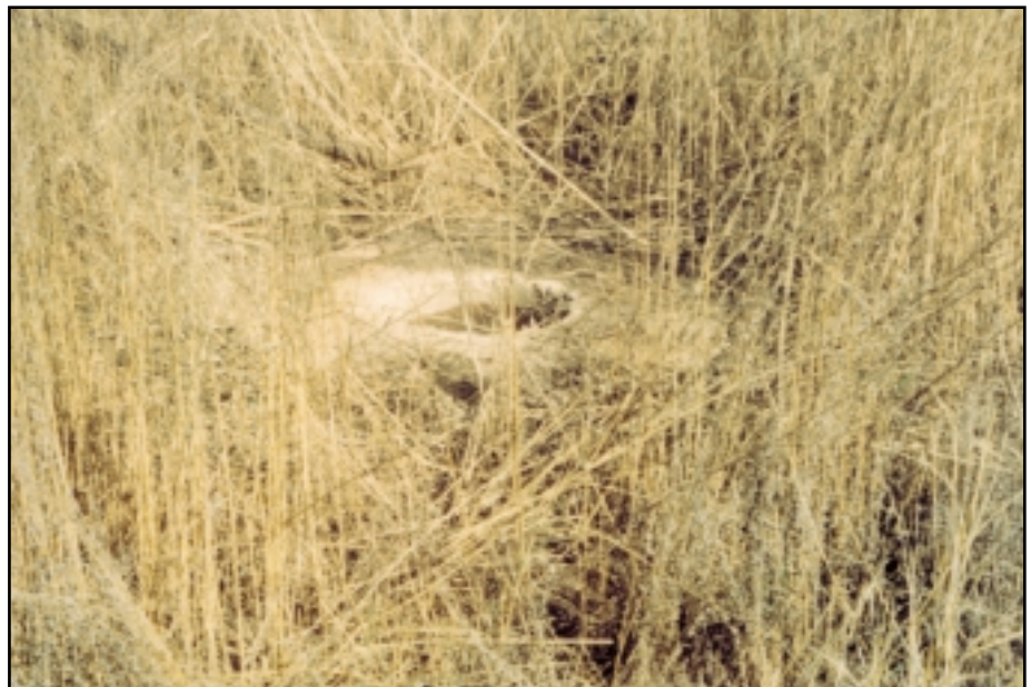
This open, abandoned irrigation well is well hidden on CRP land. Groundwater Conservation Districts work to make sure abandoned wells are properly capped to prevent accidents and aquifer contamination.

Groundwater Conservation Districts vary in size, from partial county or single county districts to multiple county districts. Staffing levels vary from one part-time position to several full-time positions, depending upon the goals of the Boards of Directors and the contributions of the local taxpayers.